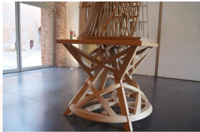
Museum of Toulouse-Lautrec

To view past and upcoming visits and trips , please visit our website.