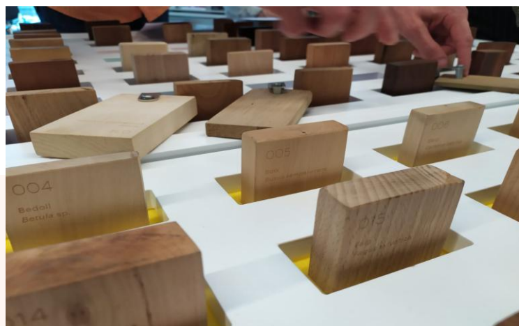
The Xylotheque of the Association for Furniture Studies

Both the virtual Xylotheque and the Minixylotheque for sale can be explored on our website.