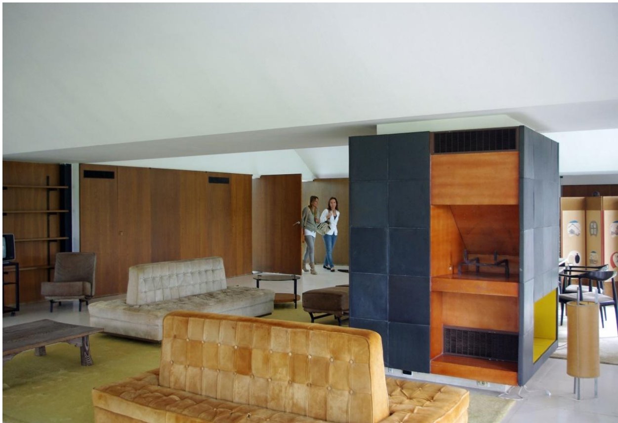
La Ricarda. Antonio Bonet

For more information, consult our site web .