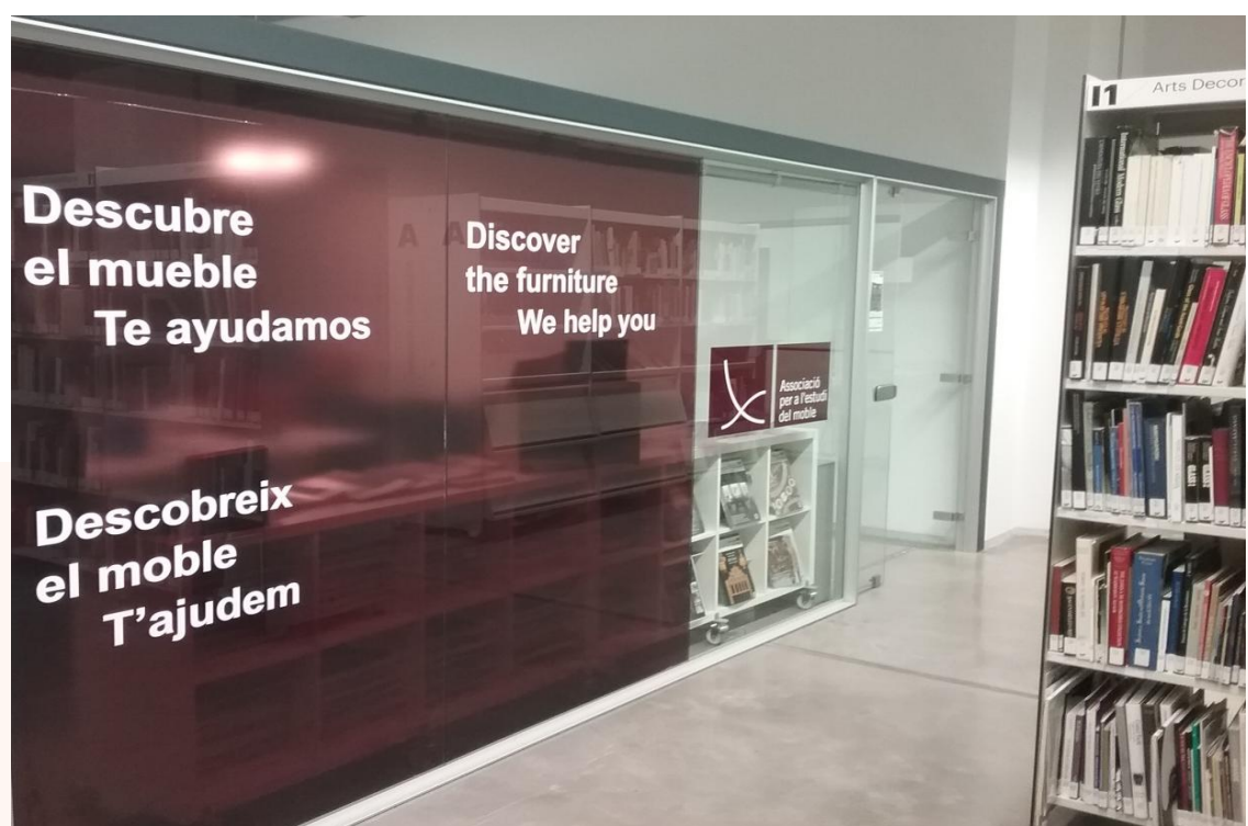
Headquarters of Association for Furniture Studies

The headquarters of the Association is located within the Library and Archive of Design. To provide better service, our library, archive, and Xylotheque are managed by the Library and Archive of Design, which facilitates book consultation and loans when needed