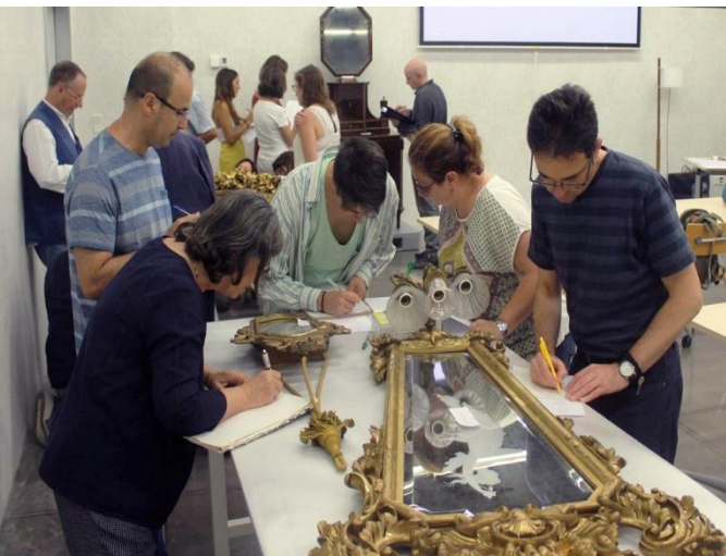
Cataloguing of mirrors

On our website, you will find all the current training activities , with detailed information about content, dates, and requirements.